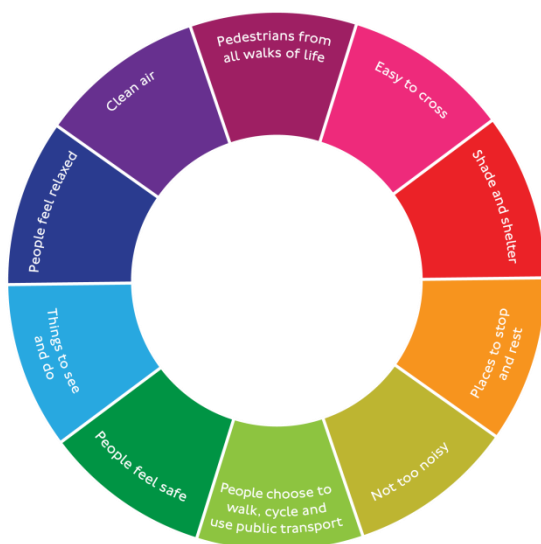
Figure 10.1 - The Ten Healthy Streets Indicators