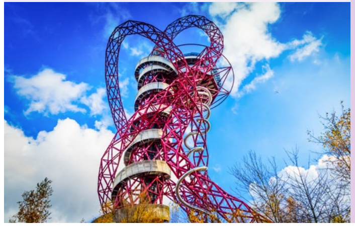
Figures for April to December 2018 show over 126,000 visitors to ArcelorMittal Orbit.

ArcelorMittal Orbit throughput of 180,000.