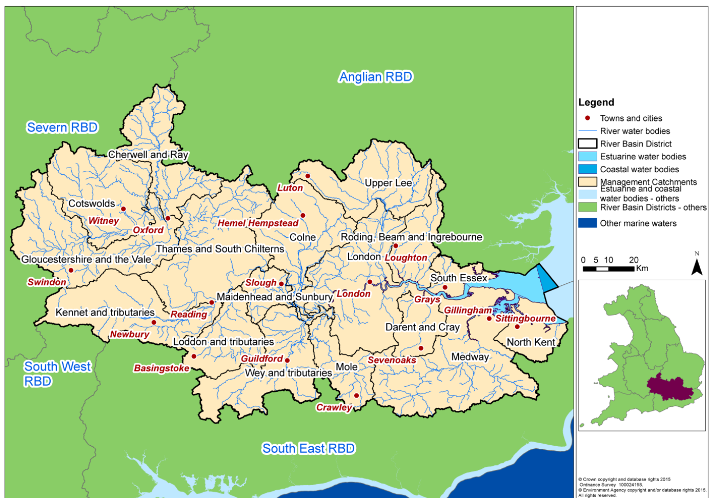
Figure 2: Management catchments within the Thames river basin district

Each catchment partnership is committed to working collaboratively to share evidence, develop common priorities and carry out work on the ground. Many partnerships are producing catchment plans that will detail local actions related to the measures in this plan. Partnerships are at different levels of maturity, so while some may have a detailed plan for measures in their catchment, others may be newly formed and may not have such a detailed view at this stage.