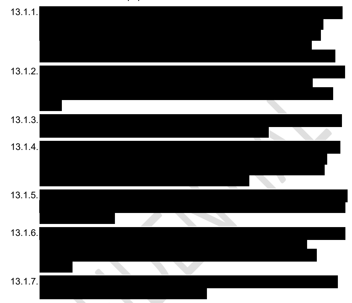
Action - Alex Williamson to produce a timeline for naming rights

The meeting closed at 16:20pm Next meeting to be held on 10 April 2019