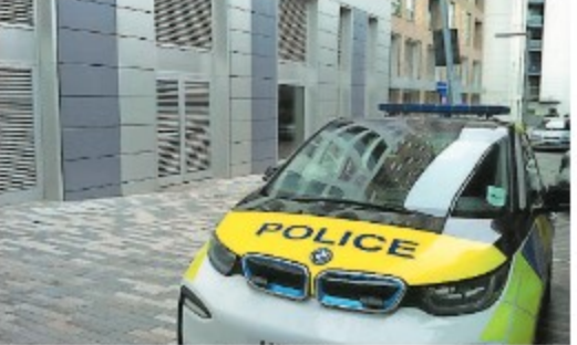
Police were called to East Ferry Road on Saturday.

At first they thought she had gone away for Christmas, but police were called in after fears grew.