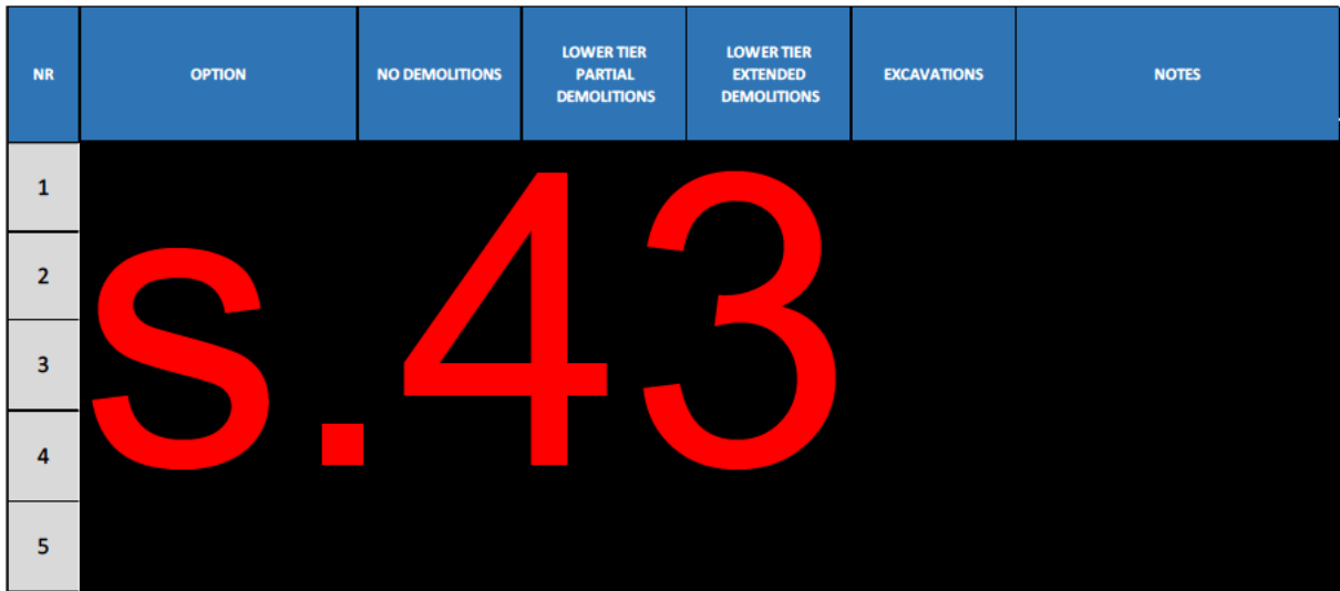
Table 4.5.3 s.43