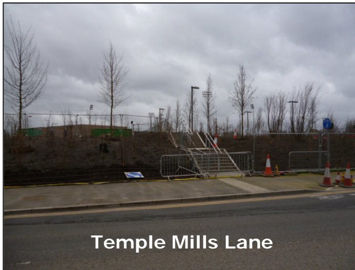
Temple Mills Lane