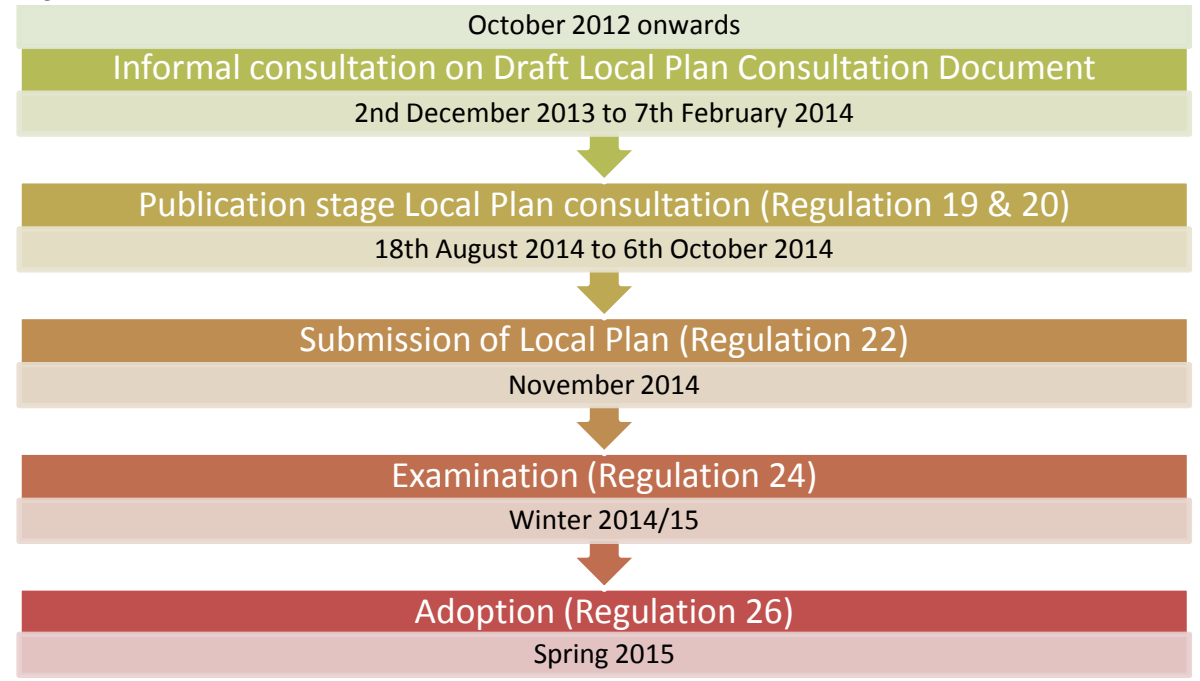
Figure 1. Local Plan Milestones