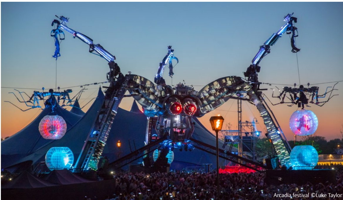
Arcadia festival

Create a diverse, unique, successful and financially sustainable visitor destination